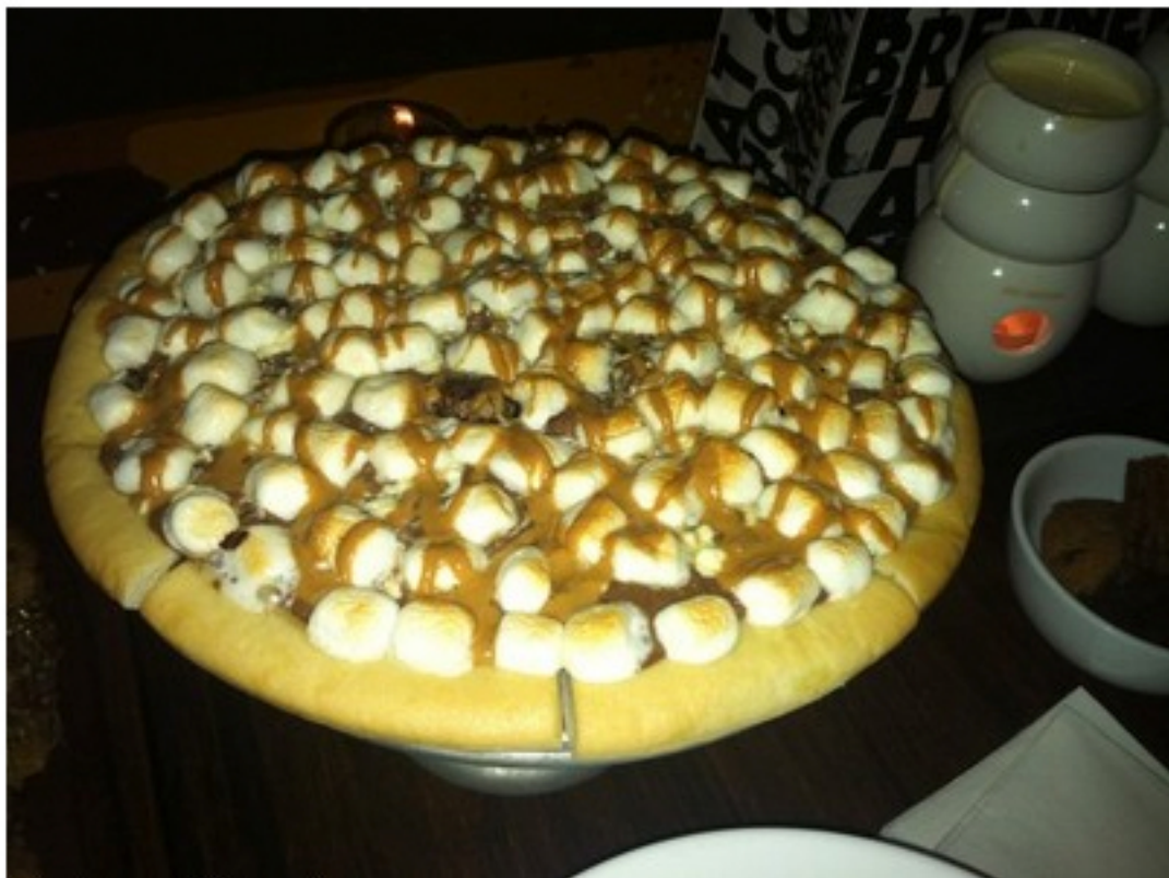
The S'mores Concoction