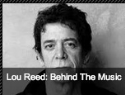
Lou Reed: Behind The Music