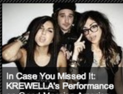
In Case You Missed It: KREWELLA's Performance on Good Morning America