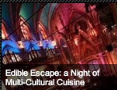
Edible Escape: a Night of Multi-Cultural Cuisine