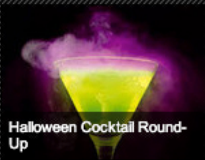
Halloween Cocktail Round-Up