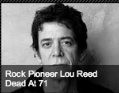
Rock Pioneer Lou Reed Dead At 71