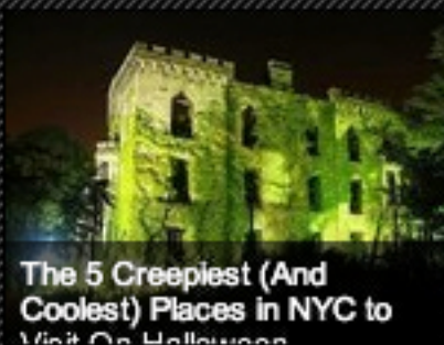
The 5 Creepiest (And Coolest) Places in NYC to Visit On Halloween